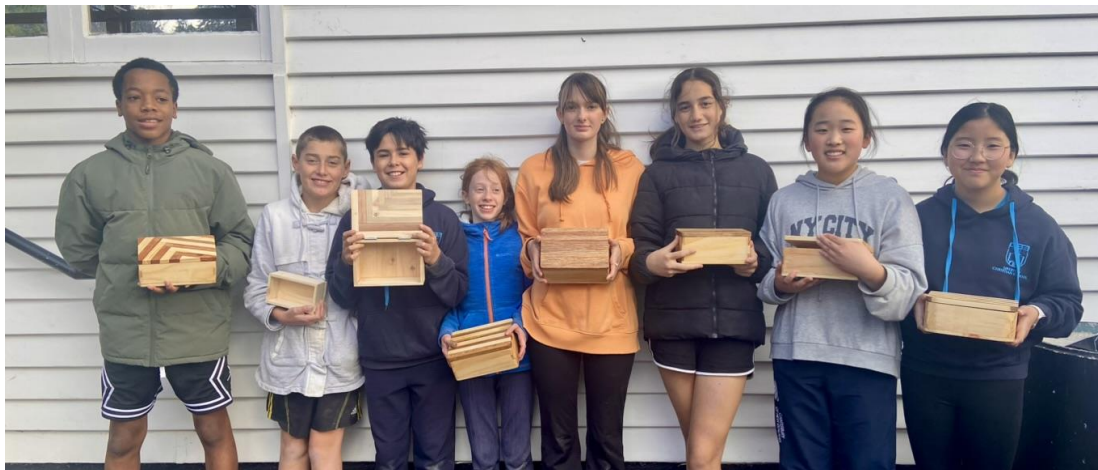
Photos this page: Groups of our intermediate students with their technology class products.