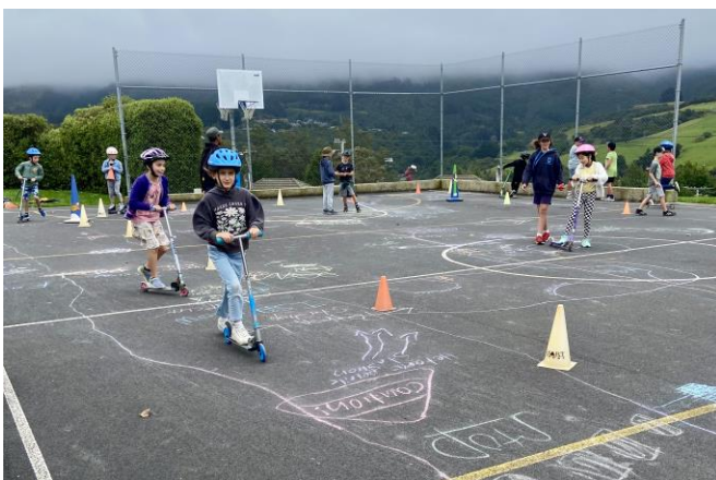
PHOTOS: Room 3 students enjoying their Wheels Day.