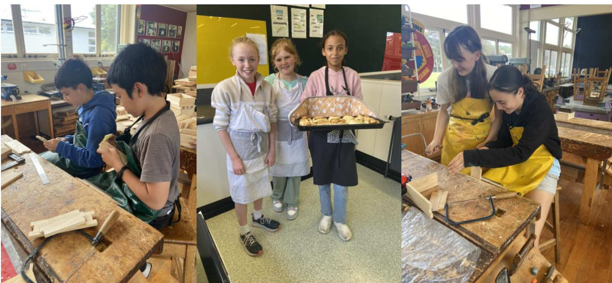
Intermediate students at DNI Technology classes (wood/metal, food, fabric, digital tech)

In Christ are hid all the treasures of wisdom and knowledge. Colossians 2v3