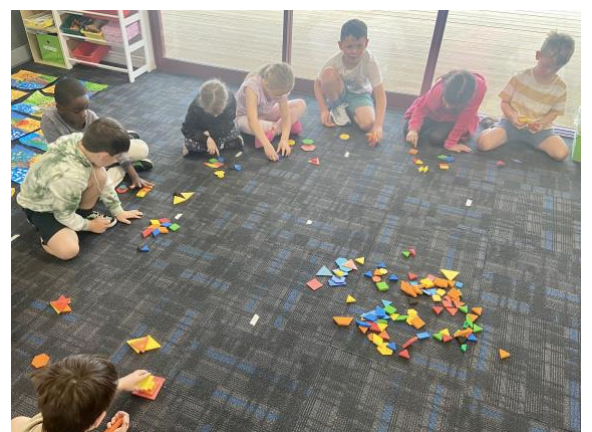
PHOTO: Room 1 mathematics learning this week.

28 January New family orientation 'pop in' 11.30am-1pm 29 January First day of term 1 for all students 6 February Waitangi Day 7 February Y5-8 Beach Education Day 24 March Otago Anniversary Day 11 April Last day of term 1