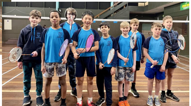
ABOVE AND RIGHT: Our senior badminton teams