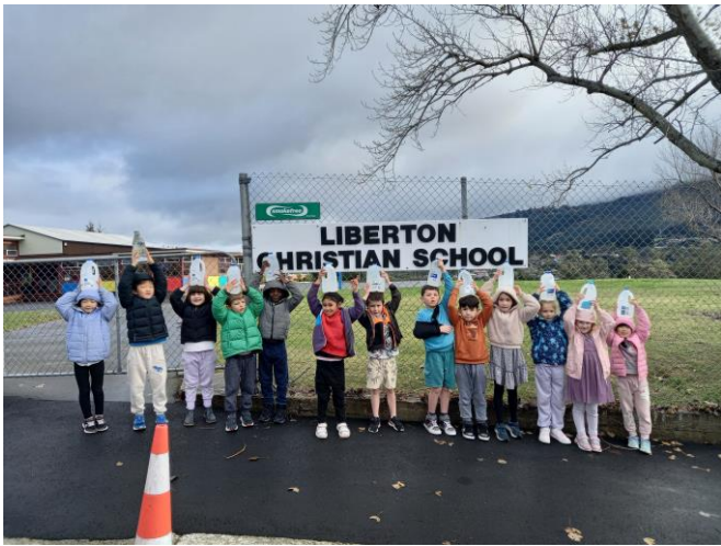
LEFT: Room 1 on their 'water walk'.