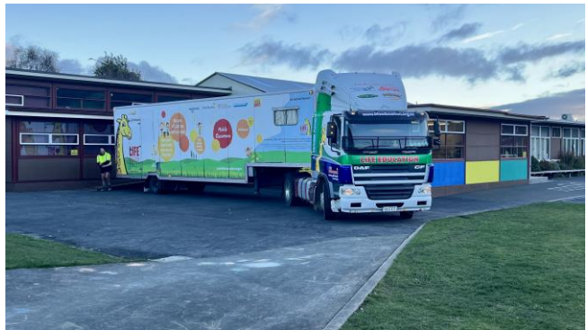
Room 4 enjoying The Life Education Truck visit