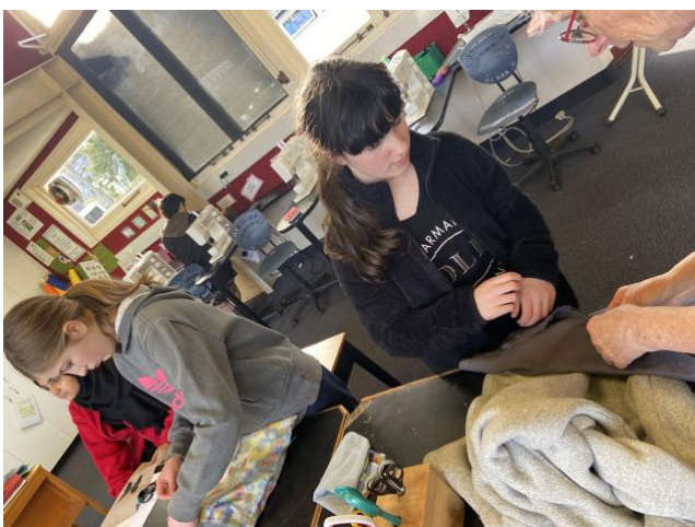
Year 8 students working at Technology Classes at DNI