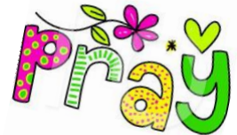
BELOW: Easter service at Hope Church